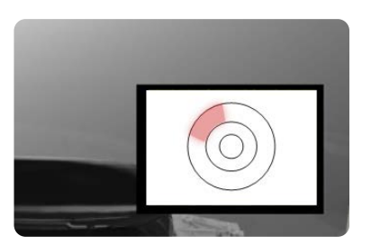
Close object recognition