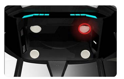
Optical collision warning from Ultrasonic sensors